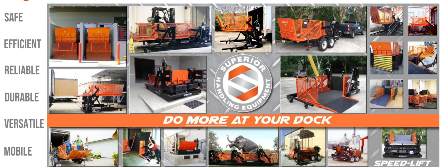
Superior Handling Equipment has manufactured the American-made Speed-Lift<sup>™</sup> for over 40 years. It's the only dock lift that utilizes a robust cantilever-motion design and Automatic Folding Ramps to safely and quickly load/unload trucks. The company's focused effort on this lift's development has culminated in a product line that incorporates maximum safety, productivity, and flexibility with its standard features and customizable options, all of which reinforce its durability, reliability, and operational efficiency.